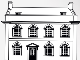
PRIORY HOUSE HERITAGE CENTRE

News, Announcements and Items of Interest for Residents of Dunstable