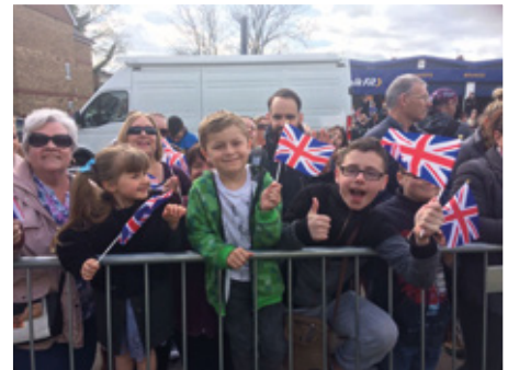
Excited residents awaiting the arrival of the Royal visitors