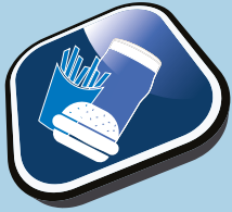
BAR & FOOD