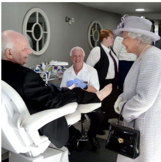
The Queen witnesses a pedicure underway at Priory View's salon