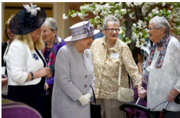
The Queen talks with a group of Priory View residents

She said: "I had a few words with her, which was lovely. I was emotional; very emotional. I told her how it has made a big difference living here. I couldn't help myself – I was getting more and more excited."