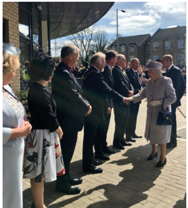
The Queen is welcomed to Dunstable by the official greeting party

Local people turned out in force to welcome the Royal Couple, lining High Street North with a sea of waving Union flags.