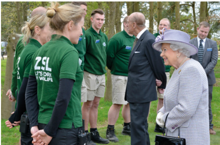
The Queen meets staff at ZSL Whipsnade Zoo

Asian elephants ( Elephas maximus ) are classified as endangered on the IUCN Red List of Threatened Species, and due to habitat loss, human conflict and poaching their wild populations are in decline. The species are also listed on ZSL's EDGE (Evolutionarily Distinct and Globally Endangered) list, meaning there is a particularly urgent need for conservation action. ZSL is working in Thailand – a major stronghold for Asian elephants – to reduce human-wildlife conflict and ensure the peaceful coexistence of elephants and humans.