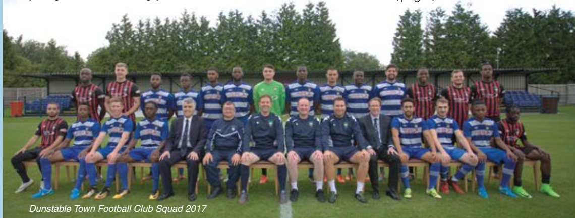
Dunstable Town Football Club Squad 2017

@DunstabletownFC https://www.dunstabletownfc.co.uk/ www.facebook.com/pages/Dunstable-Town-FC