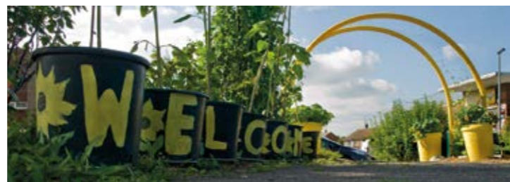
Incredible Edible Winner of the Best Community Project 2014