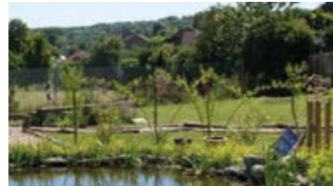
Queensbury School Environment Centre Winner of Best Young Person's Project 12 - 18 yrs in 2010