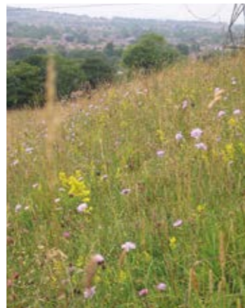
Blows Down Hay Meadow - Best Conservation Project Nomination 2011, 2017 and 2018