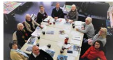
The 'In Bloom' Team planning for 2019