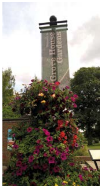
Grove House Gardens - Gold and Winner of the Best Public Open Space 2016

Dunstable in Bloom and the Town Council would like to thank all its supporters and project volunteers who have given their time and energy to making the town's In Bloom campaign such a success.