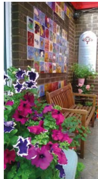
Weatherfield Academy - Winner of Best Young Persons Project 2016

Dunstable in Bloom, in partnership with the Town Council and many voluntary organisations, schools and businesses has had many great successes since first entering Anglia in Bloom in 2010. The town started with a Gold medal and has won 7 Golds and 2 Silver Gilt medals to date. There have been other great success too, including 22 special award nominations with 8 projects going on to win their special award category and classed as best in the Anglia region. Here are some photos of some of those nominees and winners.