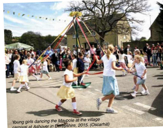
Young girls dancing the Maypole at the village carnival at Ashover in Derbyshire, 2015.

Saturday 17 August 10.00 am to 4.00 pm, if you missed the winter snow globe last year, come along to the beach globe in August! A beach snowglobe in the middle of summer. Play in the snow on the beach and have a free picture to remember your day.