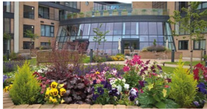
Priory View - Winner of the Best Sheltered Housing Garden 2017