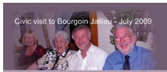
Civic visit to Bourgoin Jallieu - July 2009